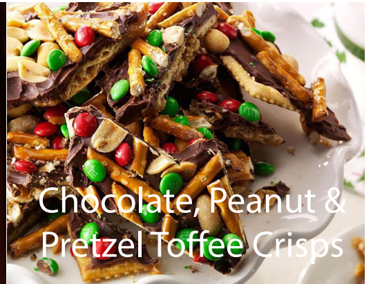
Chocolate, Peanut & Pretzel Toffee Crisps