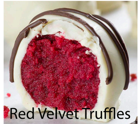
Red Velvet Truffles