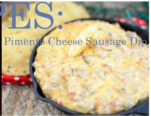
Pimento Cheese Sausage Dip