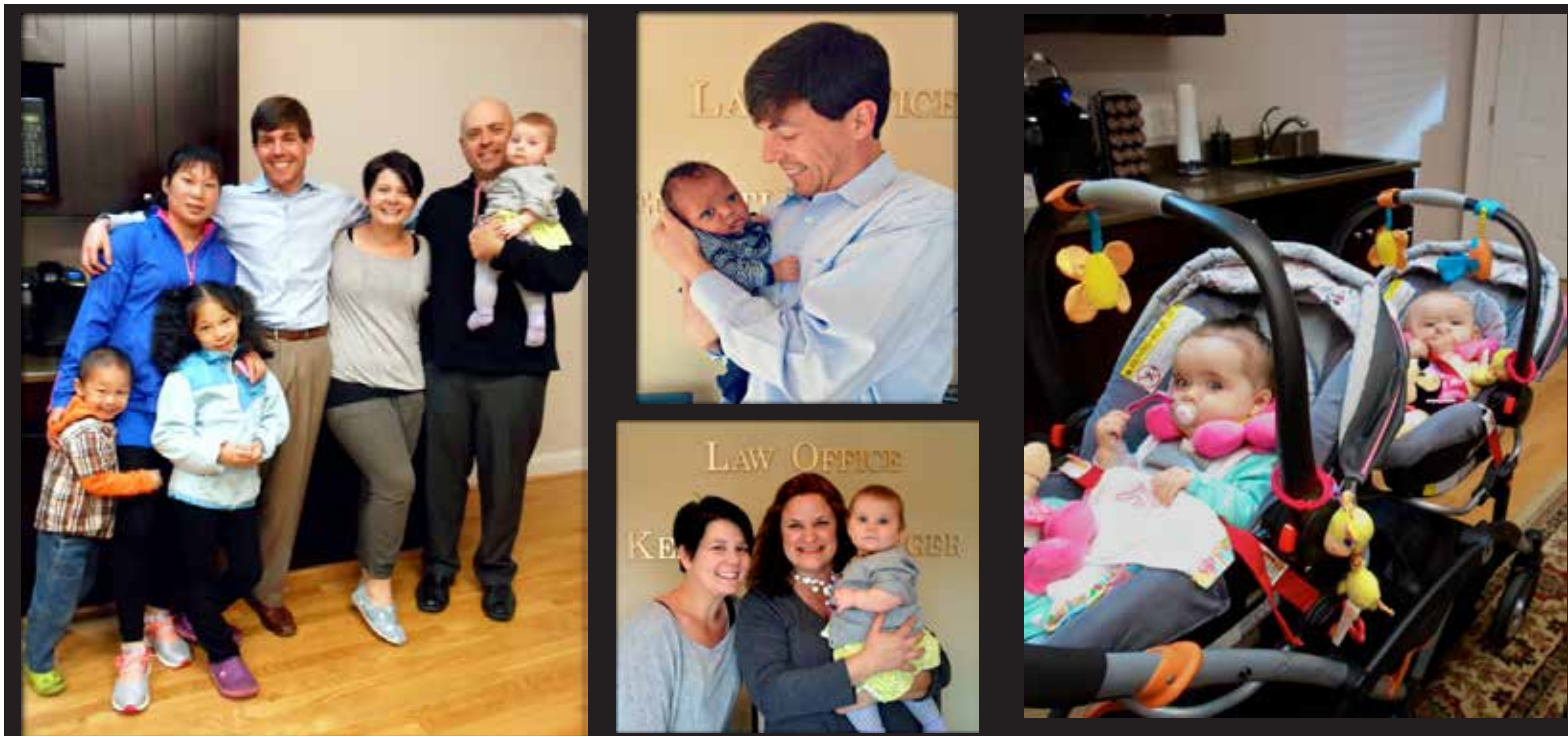
HERE AT THE FIRM, WE WELCOME VISITS FROM OUR CLIENTS, FRIENDS, AND THEIR ADORABLE BABIES!