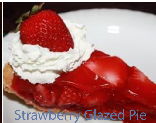
Strawberry Glazed Pie